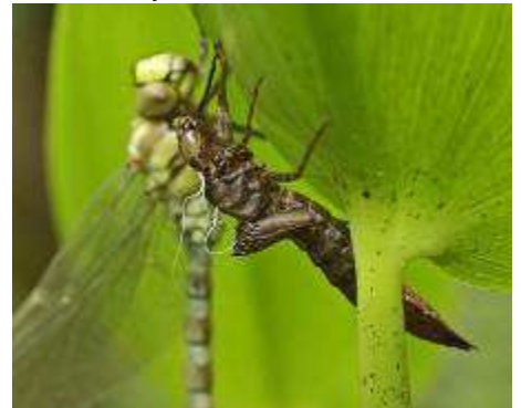
The emerged Southern Hawker Dragonfly