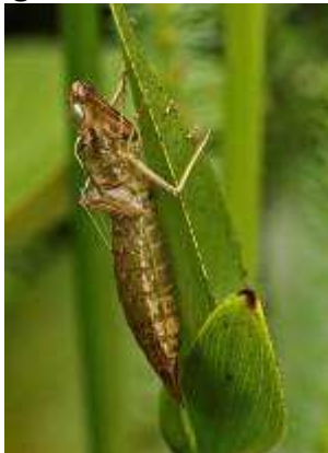
Dragonfly nymph about to hatch