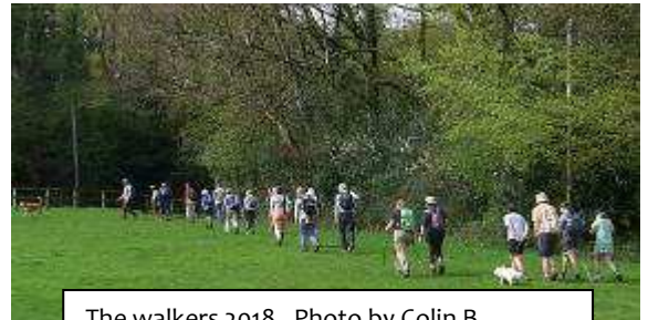
The walkers 2018.