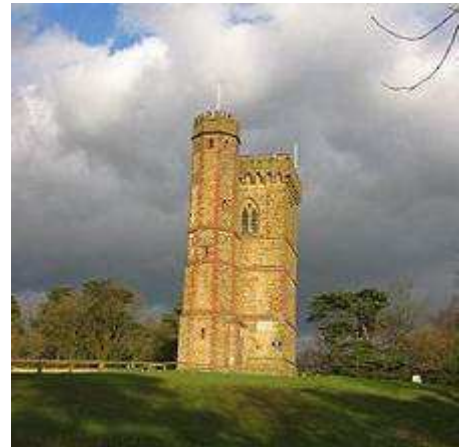
The tower on top of Leith Hill

He says that there were 1,550 objections to the planning application from local people, and bodies that have opposed the proposal include the parish council, the district council and the county council, as well as the National Trust, the Woodland Trust, the CPRE and the AONB Board. The local water supply company have also objected strongly to the plans and have raised concerns about the risks of pollution to an aquifer that supplies drinking water to the local population.