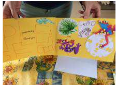
The children's Please Give poster made in their Sunday Meeting ready for the December collection.

A final decision will be made by the Children on 3rd December. Information about how to donate by post or online will then be made available during Notices in the rest of December.